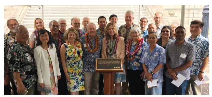
Fig.1: IEEE group picture at Iolani Palace Milestone Award dedication ceremony.

The historic timeline for this Milestone Award is listed below: • 08/15/1881: On His Royal Highness (HRH) World Tour, King David Kalakaua visited the International Exposition of Electricity in Paris, France.