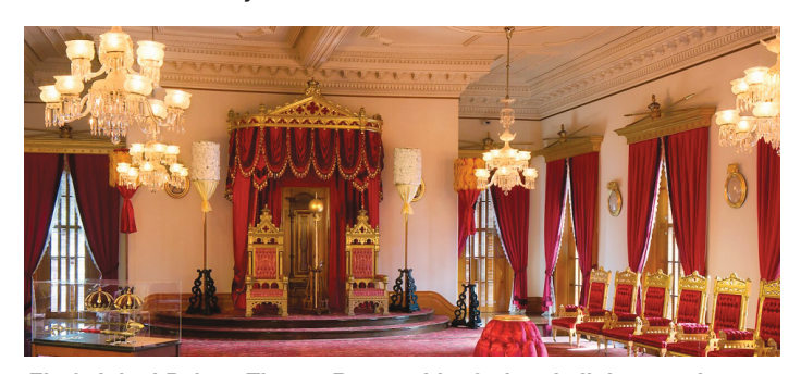
Fig.2: Iolani Palace Throne Room with 72 electric lights on six chandeliers. continued on page 4